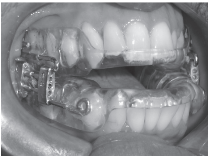
Figure 2: Lateral view of mandibular repositioning appliance (MRA) in situ